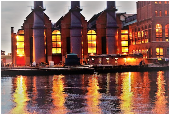
Electric Company, Providence