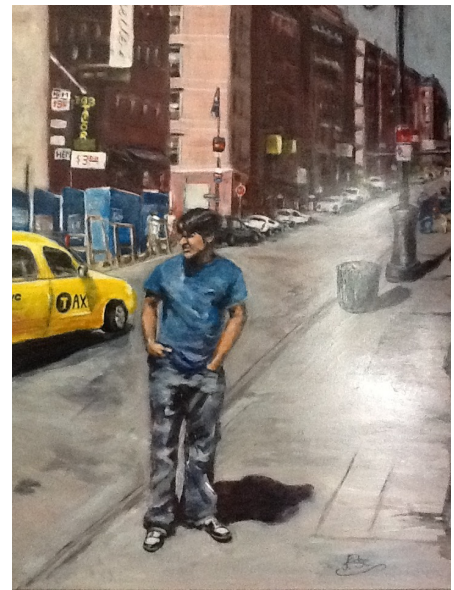
A New York Kind of Guy