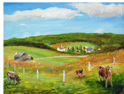
Vermont