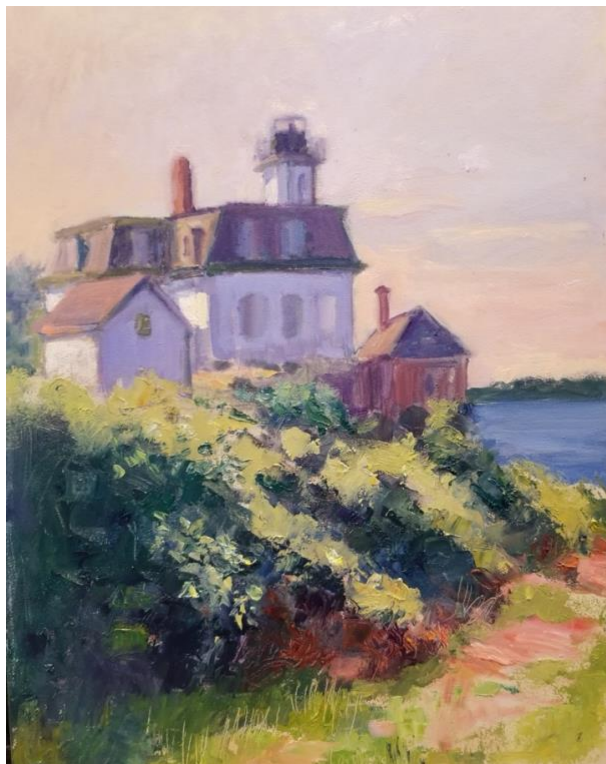
Rose Island Lighthouse, 11x14, oil on board