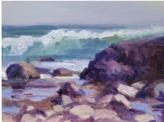
Block Island Sound, 6x8, oil on board