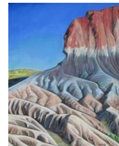
Sample of works from Kathy Hodge