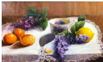
Mandarins, Lemon, Lilacs and Cup