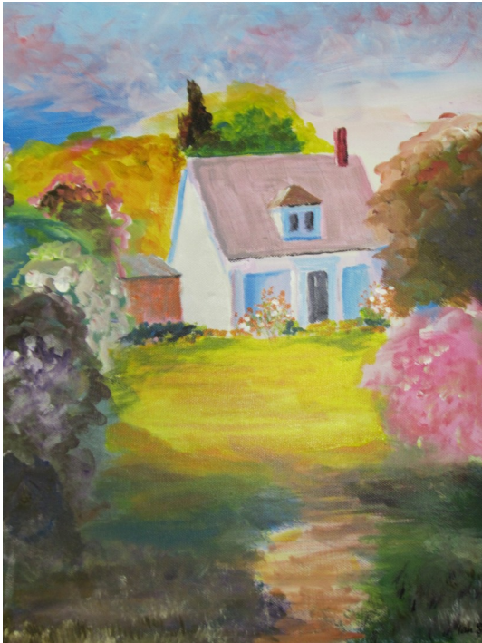
Cape Cod Cottage by Ian Sanderson