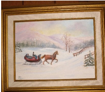
Sleigh Ride by Rita Williams

A very easy drag-and-drop system allows you to organize albums of your photos and collections of photos from you and other photographers. Once you have created an album of photos you like, you can print a 20-page photo book for $34.95 (plus $0.50 for extra pages). Overall, Flickr is our top pick and Editor's Choice award winner, thanks to its massive amount of storage and a simple, clean interface that makes it a joy to use.