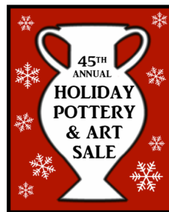
South County Art Association Holiday Sale. 11/27-12-19

18th Annual Open Studios at The Mill at Shady Lea. December 5th and 6th, 11am-5pm. 215 Shady Lea Rd. N. Kingston RI Free and open to the public.