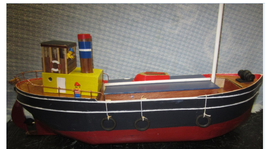
"Clyde Puffer" model boat 24" long built from scratch by Ian Sanderson