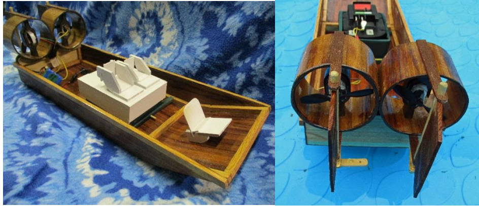
Airboat model with variable speed propellers made from scratch by Ian Sanderson