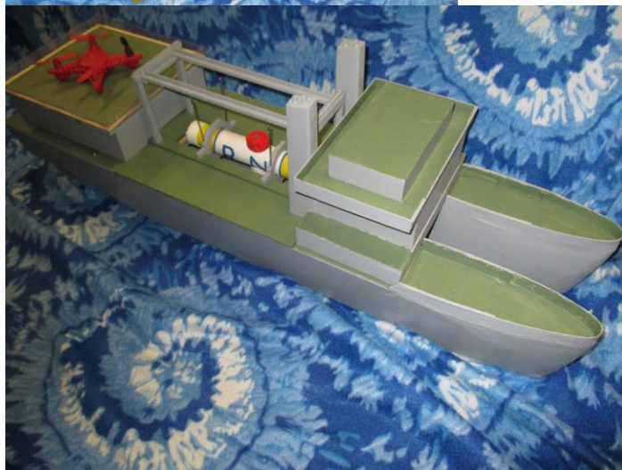
HMS Reclaim, a deep diving and submarine rescue vessel model made from scratch by Ian Sanderson