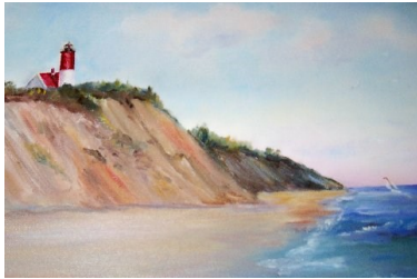
Nauset Light by Rita Williams

http://www.reddotblog.com/wordpress/index.php/