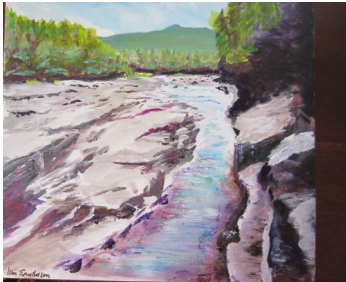
"Rocky Gorge" by Ian Sanderson

Found: white oval platter-with a thin black border and a tan square, fringed linen-type table cloth with blue and orange stripes. They will be at the next meeting for pick up or let us know who you are so we can put them aside for you at later time.